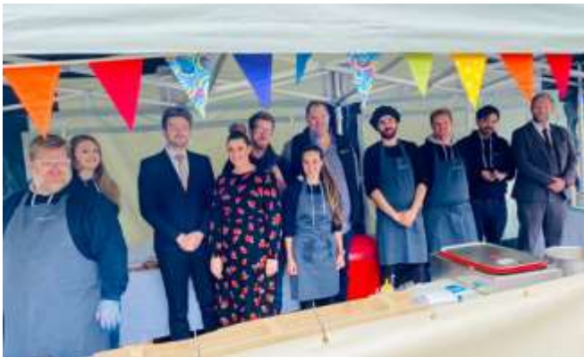
Haycock Manor Hotel Team