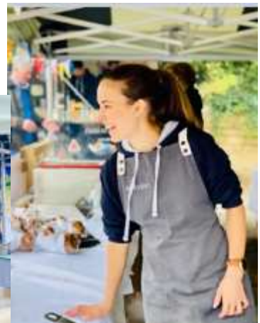
Prevost Cookery Demo