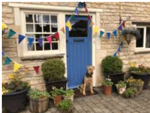
Best Doorstep: Jo Roberts

The village looked great in colourful bunting and doorsteps also decorated with vegetables and flowers. 43 people entered photographs for the 'mini show': best doorstep; most pleasing garden; best street; adult & child craft (during lock down) and best photograph (also during lockdown). In a change to tradition, we asked the