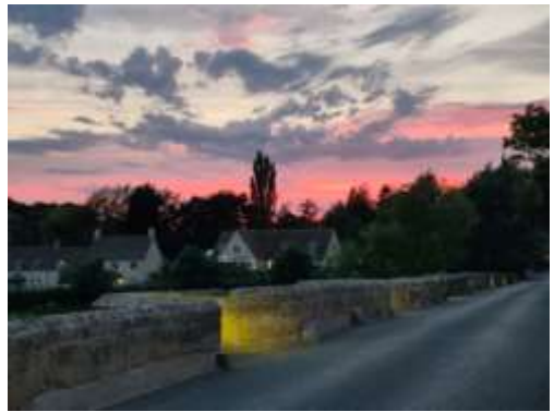
Best Photo in Lockdown : Sue Arnold

The Haycock team took a break from their major renovations and opened up a pop up gin bar, high class BBQ and entertaining cookery demos. Whilst all products were FREE, £400 in donations was collected and handed over in full to the Show charities. The team made a great impression and this bodes well for reopening of our historic hotel towards the end of the year