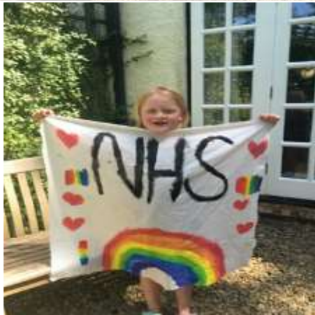
Best Craft in Lockdown (Child) :

The Haycock team took a break from their major renovations and opened up a pop up gin bar, high class BBQ and entertaining cookery demos. Whilst all products were FREE, £400 in donations was collected and handed over in full to the Show charities. The team made a great impression and this bodes well for reopening of our historic hotel towards the end of the year