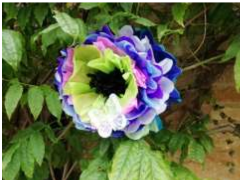
House decoration: Elton Road

Despite COVID and the coldest bank holiday on record we held a successful Show celebrating the community spirit at the heart of our Wansford village. Thanks to your generosity the Show raised £1,100 for charity.